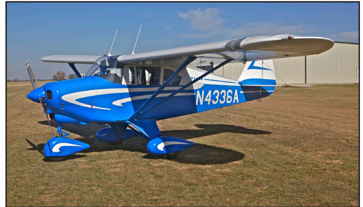
N4336A: Piper PA-22, cn: 22-3691, owned by Bruce N. Putney