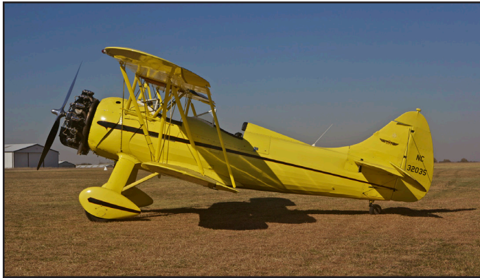
NC32035: Waco UPF-7, cn: 5666 built in 1941, owned by Wacky Jack LLC.