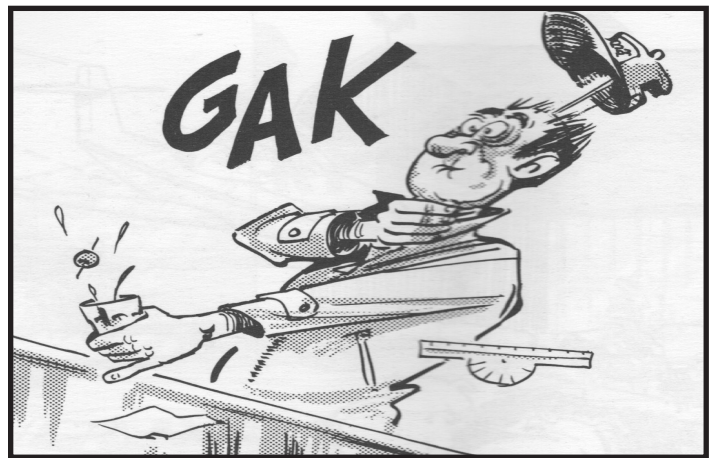
RICH MIXTURE -- Seven parts gin -- one part vermouth.

Dec. 15th: Gainesville (GLE) Annual Xmas party (Tomlinson)