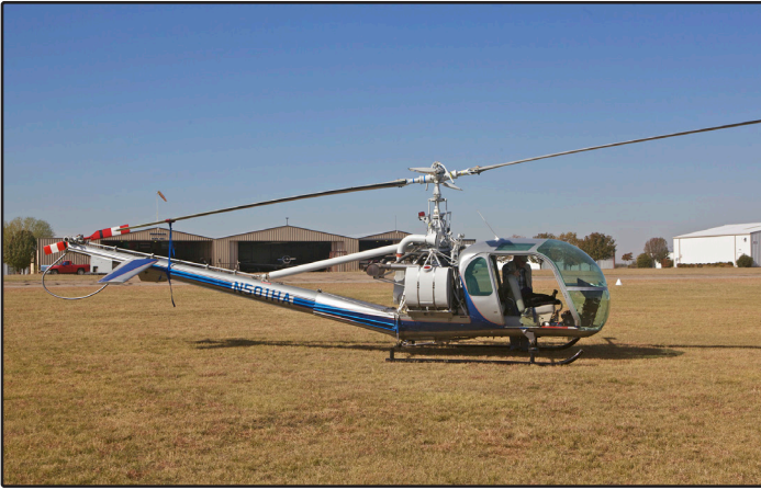
N501HA: Hiller UH-12E, cn: 2534, owned by Pat B. Pockrus